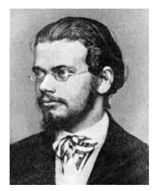
Ludwig Boltzmann (1844–1906)

Ludwig Boltzmann, Vienna, 1886 Der zweite Hauptsatz der mechanischen Wärmetheorie Lecture at the Festive Session, Imperial Academy of Sciences